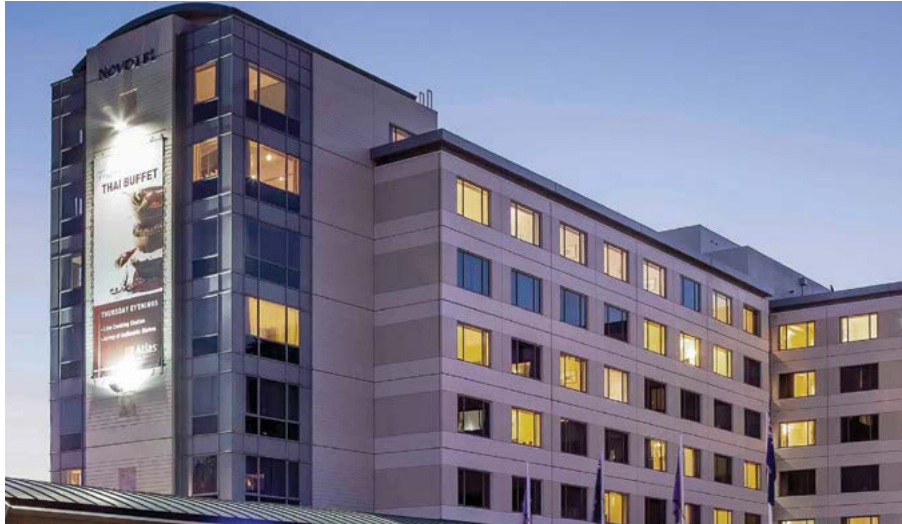
Novotel Rotorua Lakeside Tutanekai Street, Lake End, Rotorua, 3215