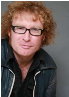
Te Radar -

“Really interesting to know what traits I have as a leader and those I need to build in my team